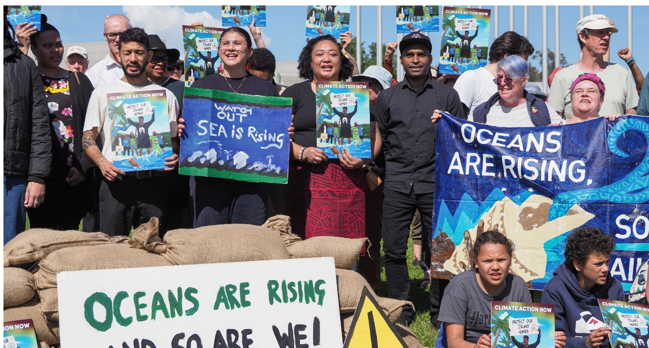
Torres Strait Islanders gather outside Parliament House on the opening of COP27.

The claimants argued that Australia had 'violated its duty to avert devastating and future irreversible impacts on rights protected by the [ICCPR], including impacts caused by existing greenhouse gas emissions'. The Human Rights Committee considered Australia's human rights obligations in line with the Paris Agreement , and found that the claimants' rights under ICCPR articles 17 (right to privacy, family and home life free from unlawful interference) and 27 (right of minority groups to enjoy their culture) had been violated.