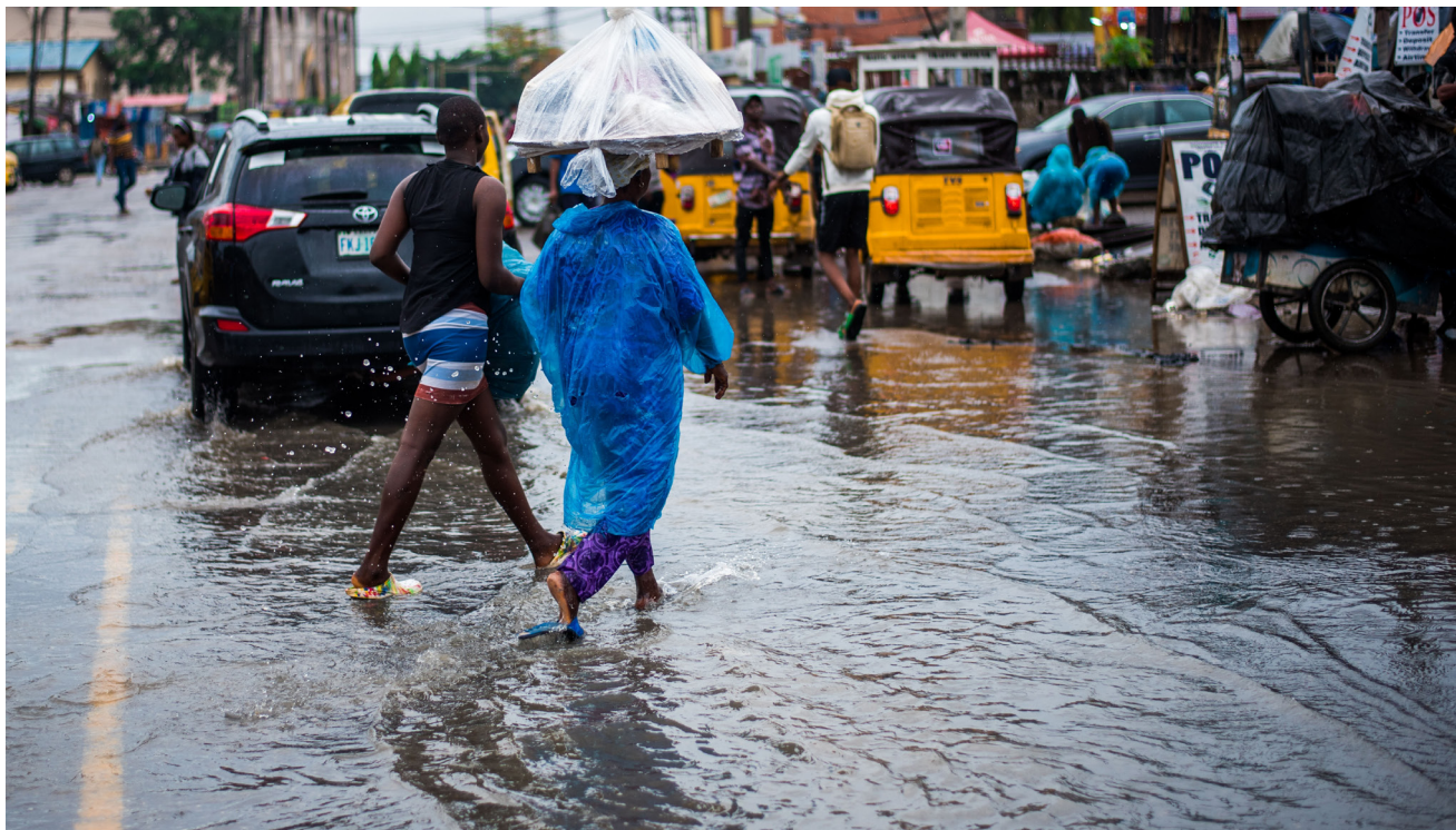
Flooding in Lagos, September 2022.

She also said that ‘with frequent flooding, the temperatures also kept getting lower every year’ and that the 2022 floods were so much bigger than what they had experienced before, and these changes scared them. Another woman asked, ‘What if the situation repeats itself?’