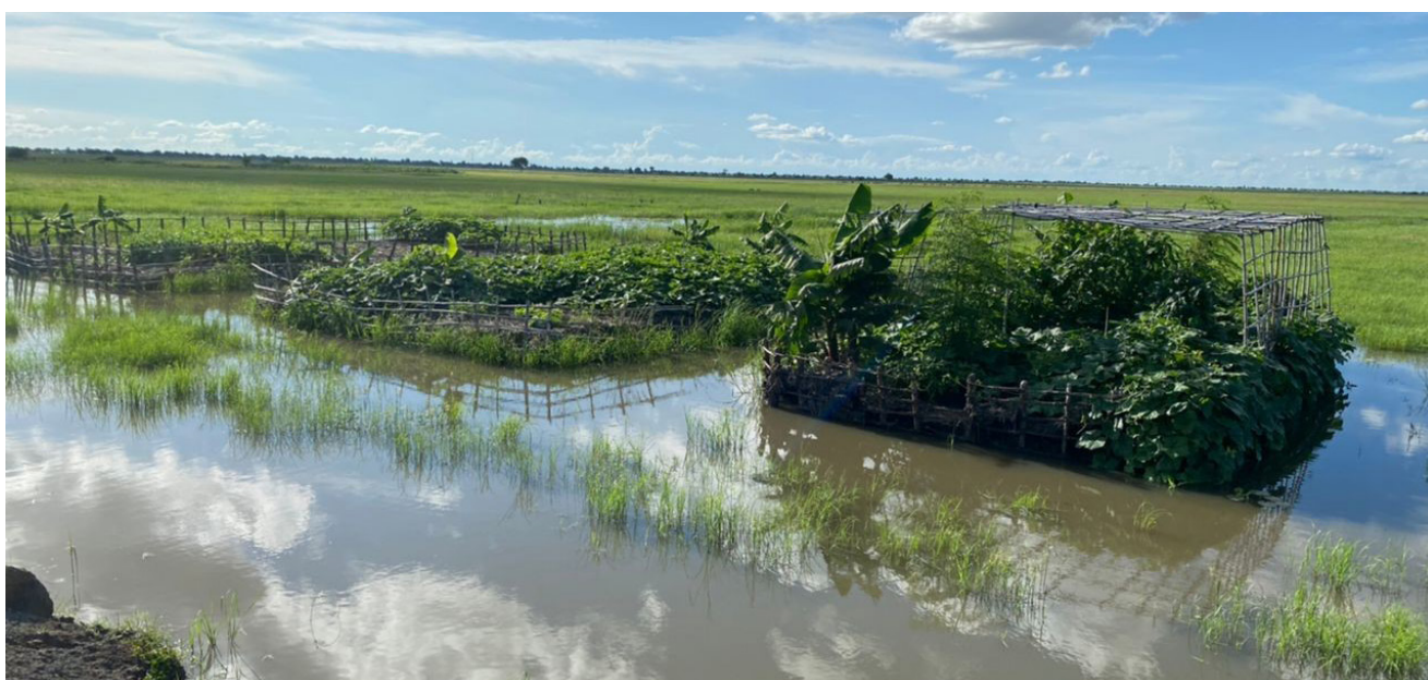
Chinampa in Bieh IDP Camp, South Sudan.

Chinampa farming is another example of a climate-adaptive technology (widely practised in Mexico) that the DRC has piloted in South Sudan. Raised agricultural beds are built by youth, men and women (via cash-for-work schemes) using soil and organic materials such as dried grass, ruminant manure, indigenous water plants and fish waste, packed layer upon layer to create beds full of fertile material and moisture. Women collect local materials to reinforce the beds' structures, particularly against erosion during periods of high water levels. Following a successful pilot, the DRC developed another eight chinampa plots in 2022 and is now adding a further 26 chinampas benefiting 148 farmers (104 women, 44 men).