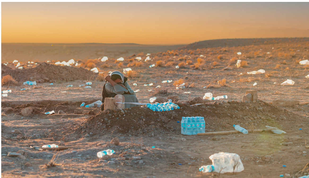
Compounding factors, including drought and earthquakes, drive food insecurity and displacement in Herat, Afghanistan.

study included qualitative interviews with IDPs and host communities living in and around Herat city. The field work for the study was conducted during mid-2022, and ODI published the report in November 2022. The article elaborates on the approaches taken by the IDPs and host communities to address the intricate challenges posed by climate change. These adaptations relate to water scarcity, energy sources, climate-driven cooling solutions, food preservation solutions and livelihood diversification.