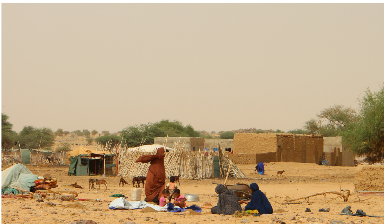
In Kidal, Mali, lives are affected by both climate and armed conflict.

Growing climate risks and environmental degradation in areas of origin, often combined with persisting insecurity, may prevent displaced people who wish to go back home from achieving a durable solution through safe, dignified and sustainable return. These factors impact people's safety and their livelihood options. In such circumstances, policies and practices that put pressure on displaced people to return to their places of origin may contribute to (re)exposing returnees to the risk of natural shocks and hazards, thus leading to unsustainable leaving conditions and, at times, re-displacement. In the case of Afghanistan, people displaced internally or abroad who were forced or pressured to return to their areas of origin have faced obstacles to re-establish their lives in safety and dignity due to insecurity, limited access to water, land degradation and inability to farm, thus exposing them to further displacement or other risks.