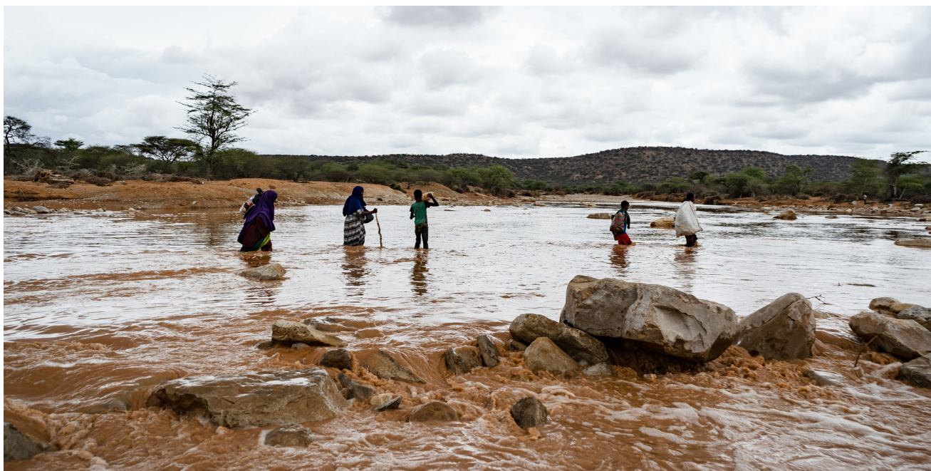
Somali family in dangerous river crossing during flash flooding in Dollo Ado, Ethiopia.

The resettlement took place smoothly, following consultation with the local communities who belong to the same clan as the IDPs. However, four years after resettling there, the former IDPs could not engage in any production activities – no agriculture or livestock – due to drought. Thus, climate change reinforces the vulnerability of the displaced communities and complicates institutional responses to displacement. Yet, policymakers and practitioners do not include the possible impacts of climate change in their planning. A combination of conflict, drought and floods prolongs the vulnerability of the displacement-affected communities.