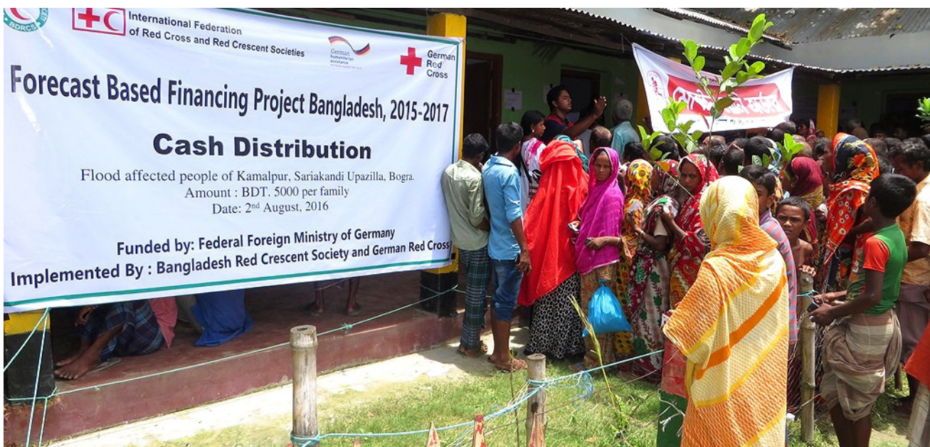
Forecast-based financing mechanisms run by the Bangladesh Red Crescent Society, 2016.

communities. Employing area-based approaches, wherein assistance is provided in areas known to hold high concentrations of forcibly displaced people as well as host populations, is one way that anticipatory action could be implemented to ensure that displaced people are not excluded from assistance at a time when they may need it most.