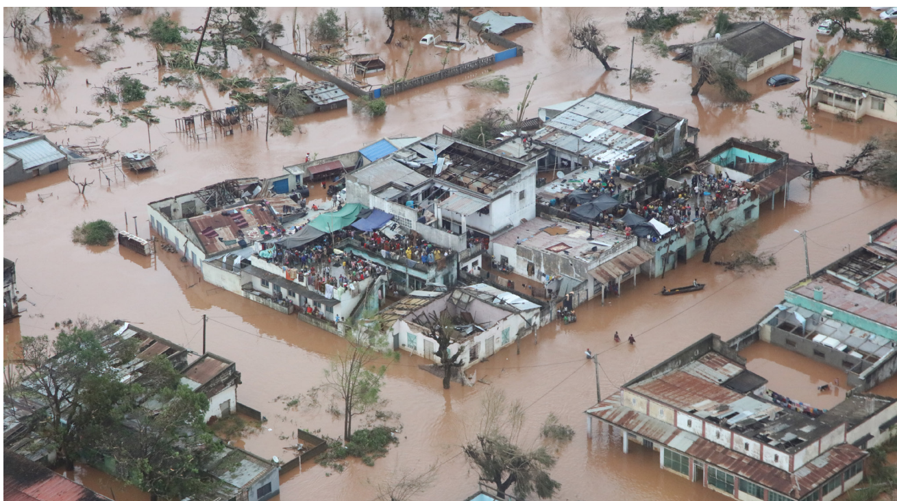
People take refuge on roofs following flooding caused by Cyclone Idai in Mozambique.

Climate change impacts are likely to contribute to a range of mobility outcomes, including immobility. 5 The research of the Mixed Migration Centre (MMC) in locations in Africa affected by climate-related events found that, predominantly, people have no intention of moving. 6 Many, particularly those who were working on the land, hold a strong attachment to place. Most participants in MMC’s research considered adaptation strategies as ways of being able to stay. Despite being repeatedly affected by severe weather events, or observing the progressive deterioration of environmental conditions, people were not considering migration – the majority were not thinking about moving away, even from crisis-affected areas. In many places, we found ‘ acquiescent immobility ’, people who did not have the resources or the capacity to move, but who also did not wish to move. But almost a quarter of those we spoke to were people who wanted to move but could not.