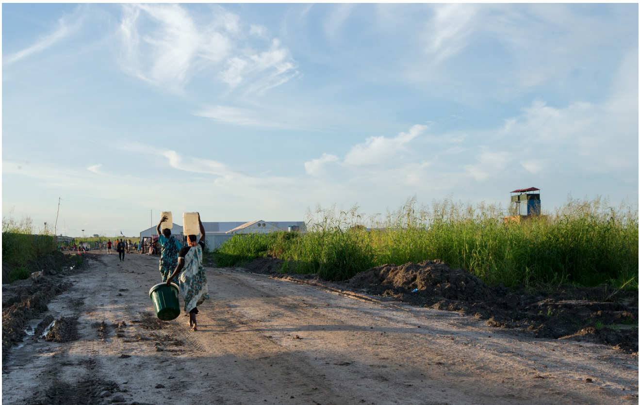
Women carry water to the Protection of Civilians site near Bentiu, South Sudan.