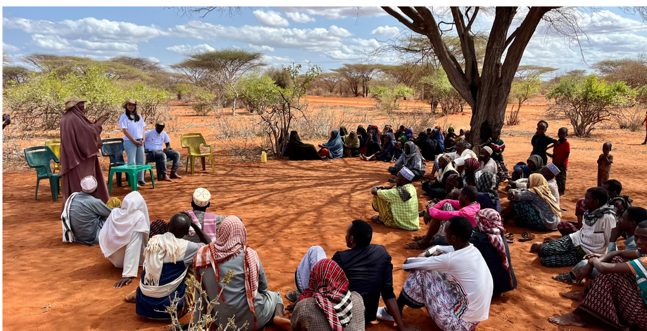
Focus group discussion with a pastoralist community in Garissa County.

One notable example of a CSO making a positive impact within Garissa County is Pastoralist Girls Initiative (PGI) . In partnership with World Jewish Relief , PGI has undertaken a multifaceted initiative in the Saka Ward pastoralist community. This initiative encompasses the provision of water storage containers, the training of community health volunteers in hygiene promotion, and the construction of water, sanitation, and hygiene facilities in anticipation of the El Nino climatic phenomenon. Through the strategic placement of these facilities within educational institutions and by providing comprehensive training to female community health volunteers on menstrual health management, this intervention effectively tackles several gender-related challenges. Notably, it addresses issues like low school enrolment rates and the unmet need for sexual and reproductive health services that disproportionately impact pastoralist communities in the region.