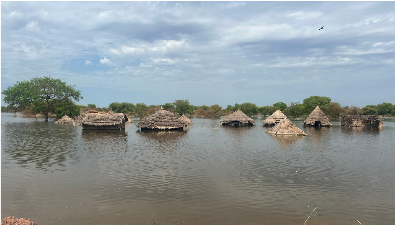
Flood-affected houses in South Sudan.

When it comes to coping and adaptation strategies, communities in South Sudan still practise traditional early-warning approaches based on bird signs, star observation and wind direction. These systems are limited, but they provide the best guess for the community as to whether there will be drought or flood this year. South Sudan currently has five manual weather stations but only two of these are functional, making it the East African country with the least number of weather stations. The capacity of the South Sudan Meteorological Department to provide weather forecasting and climate modelling remains very limited. The government of South Sudan is currently working with the United Nations Development Programme to establish a Multi-Hazard Early Warning System (MHEWS) to be able to provide weather forecasting and climate modelling, and to use earth observation and geospatial data to predict climate vulnerability, migration trends and conflict risks. This system will also map conflict hotspots along migratory routes and provide conflict early warning to enable communities, government and peace partners to prevent conflict.