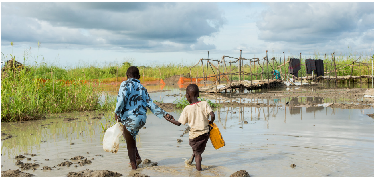
Flooding near the Protection of Civilians site in Bentiu, South Sudan in 2014.

cultivation, hence not worsening the food insecurity situation in the same way as drought. Also, a good number of households depend on fishing along the River Nile tributaries; during flooding, fish swim into the flood waters to household level, increasing access to fish as food.