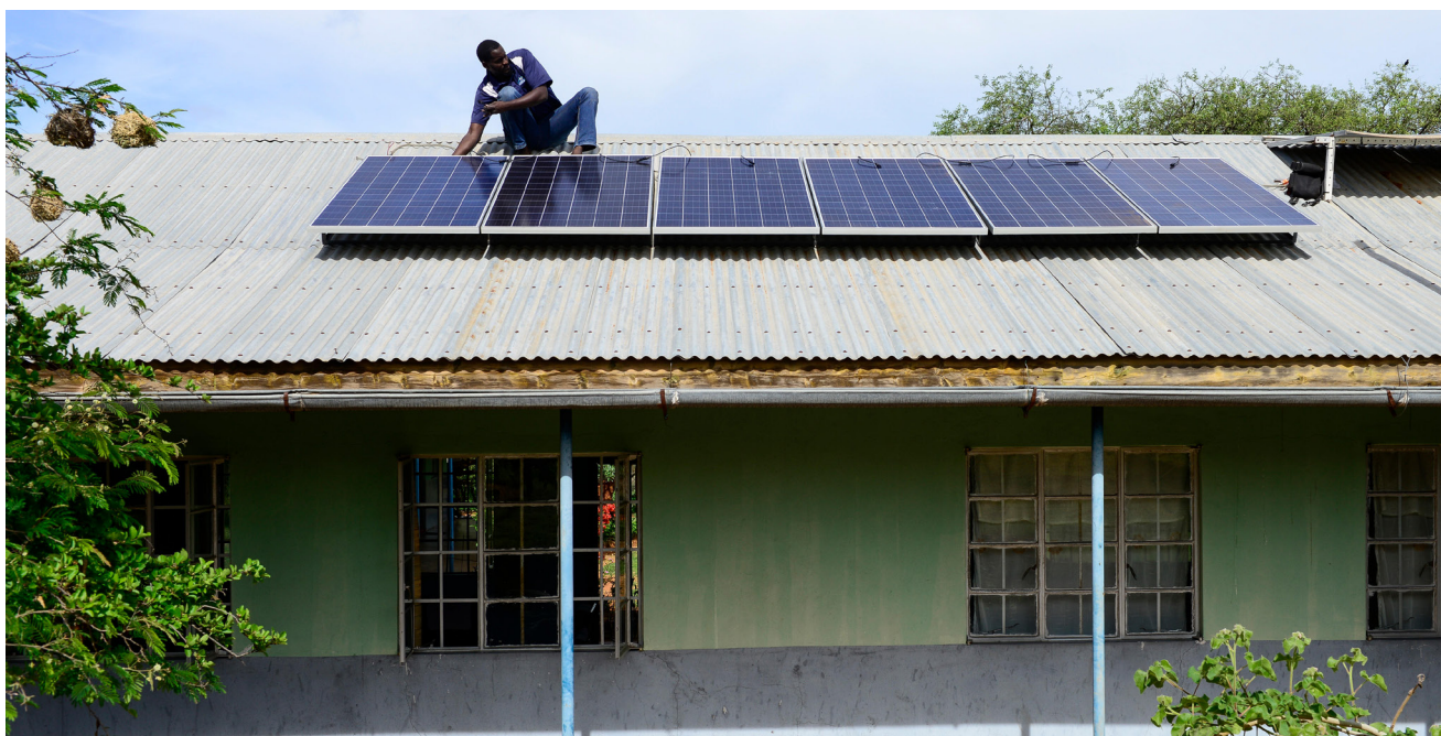
Installing solar panels on a Karamoja house, Uganda.

As observed, there is a disparity in vulnerability amongst countries regarding readiness and adaptation to climate change. Climate change remains a direct trigger for displacement and conflict within vulnerable areas, as seen in some parts of Kenya and Uganda, which not only calls for an even burden sharing of consequences but also for those that pollute the most to take responsibility and care for the marginalised. For the above suggestions to be successful, the ethical and moral standards and call