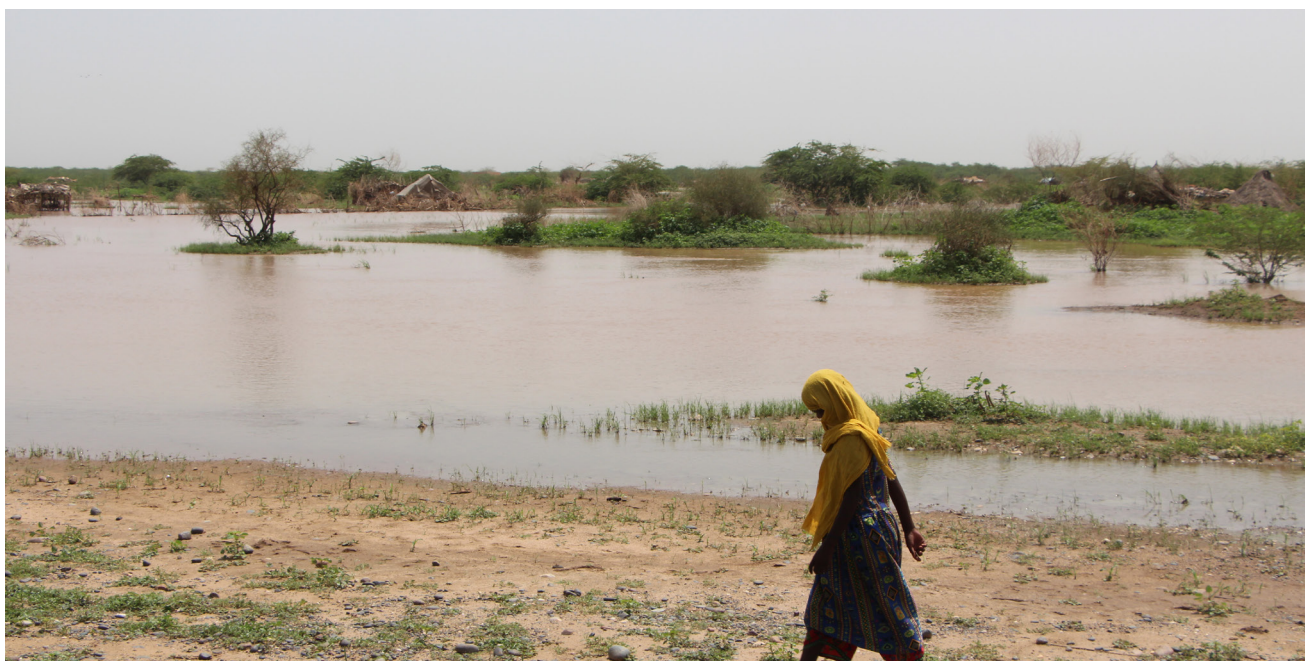
In Sudan millions are affected by droughts and flooding.

environments; and increasingly occurring within existing conflict environments – fuelling new or prolonging conflict dynamics as communities feel resource constraints. Ultimately, it is likely the climate crisis will influence every aspect of humanitarian action, and not be a discrete issue as sometimes perceived. Humanitarian actors must fundamentally shift their mindset away from being geared towards protracted conflict crises and one-off disaster events, and towards approaches that consider cascading risks and a state of global ‘polycrisis’.