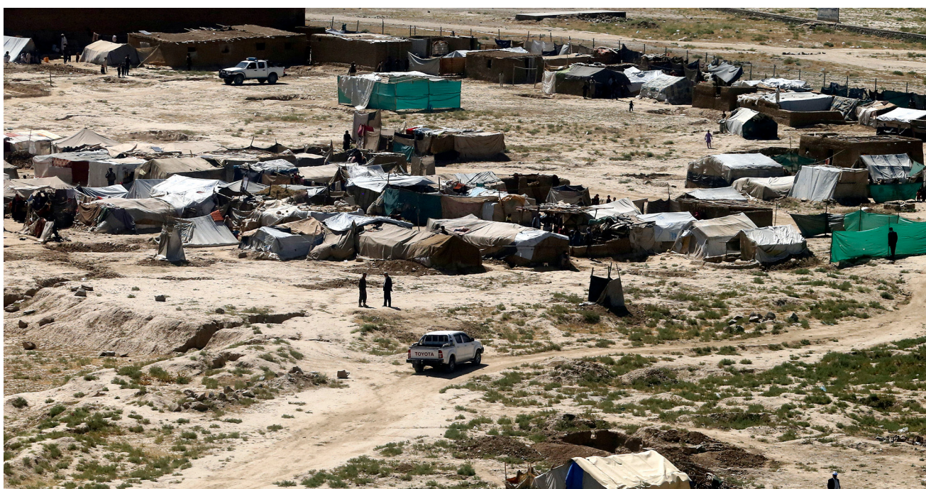
IDP camp outside Kabul, Afghanistan in 2017.

The humanitarian community, including the Humanitarian Country Team, is actively engaging with other partners and basic-human-needs actors. They have developed a monitoring and reporting framework to assess the impact of the ban on access, sectoral and local authorisations, and the ability of humanitarian partners to operate within the recommended criteria. Ongoing assessments are being conducted to understand the ban’s impact across all sectors, and advocacy efforts are in progress to engage with the authorities and overturn the ban. Based on monitoring outcomes and advocacy efforts, a comprehensive review of the operation and a revision of the HRP will be conducted as necessary.