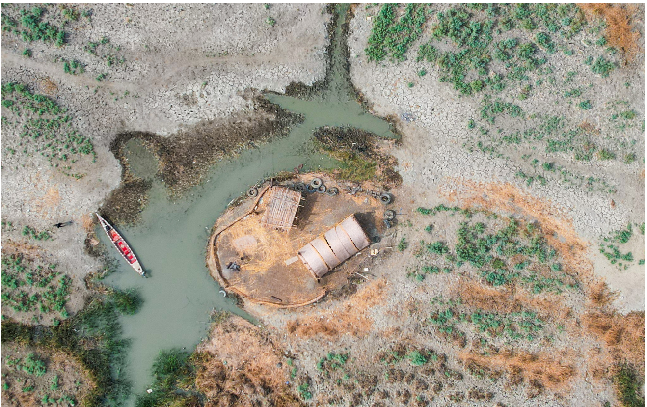
A boat on the banks of what was once a river.

This article draws on the authors' recently published report, Inadequate and inequitable: water scarcity and displacement in Iraq .