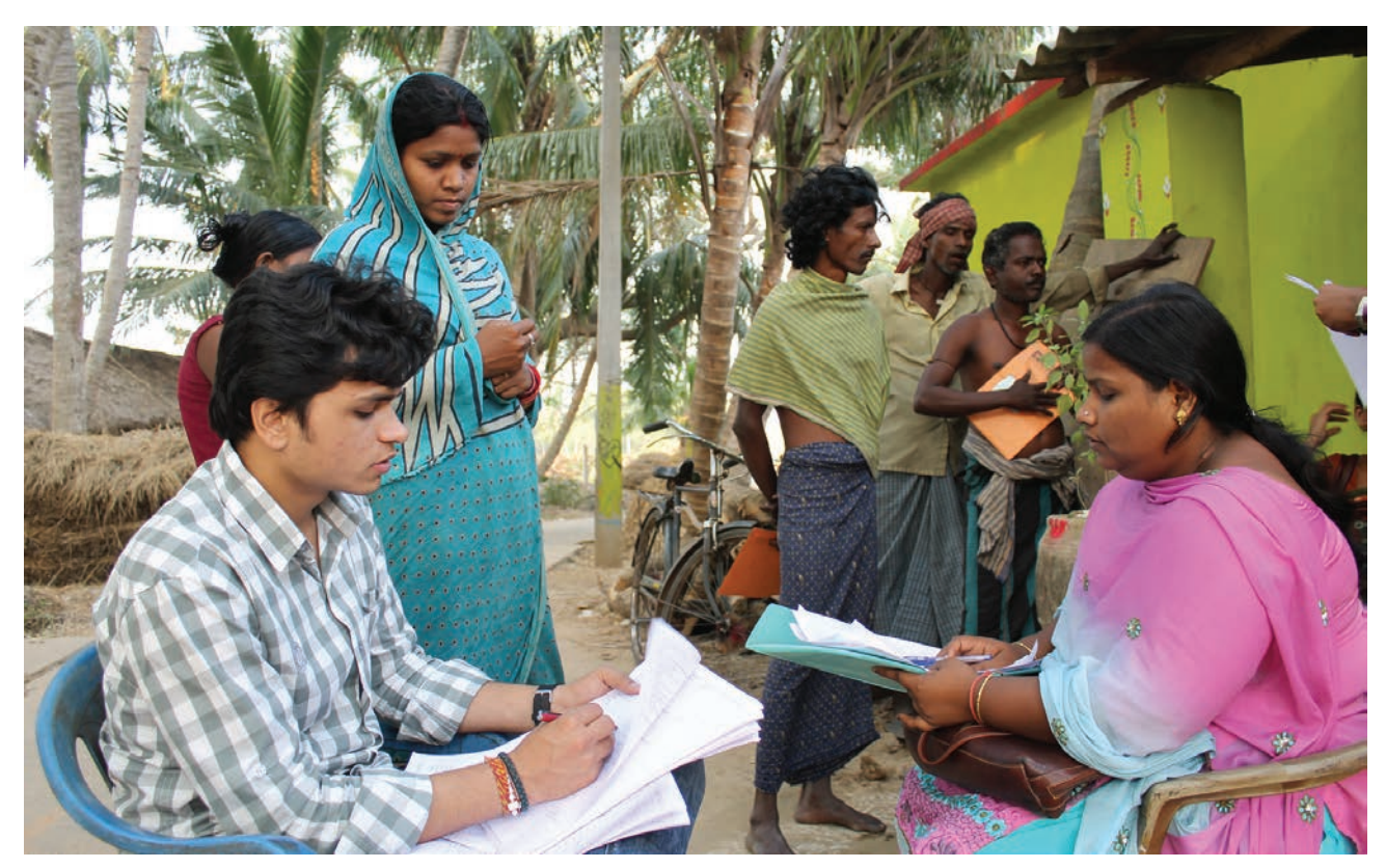
Discussions about the effectiveness of Afat Vimo disaster insurance following Cyclone Phailin in 2013

(HIF) to design and implement a microinsurance scheme for urban informal small businesses, and to study its impact on small businesses and its effectiveness in promoting local market recovery. Using a randomised control trial (RCT) design, the study team allowed half of the business owners that intended to buy insurance to actually purchase it. The other half – those not given the opportunity to purchase microinsurance - will serve as the control group. Because of randomisation, we can assume that both groups, those with insurance and those without, are similar in all other respects, and that any differences, such as time to recovery, method of recovery and risk reduction behaviour, can be attributed to the insurance. The study will compare how each group of owners is impacted by a disaster, if and how quickly they recover, what coping mechanisms they employ, how business and household finances are affected and what disaster risk reduction efforts they engage in before the event.