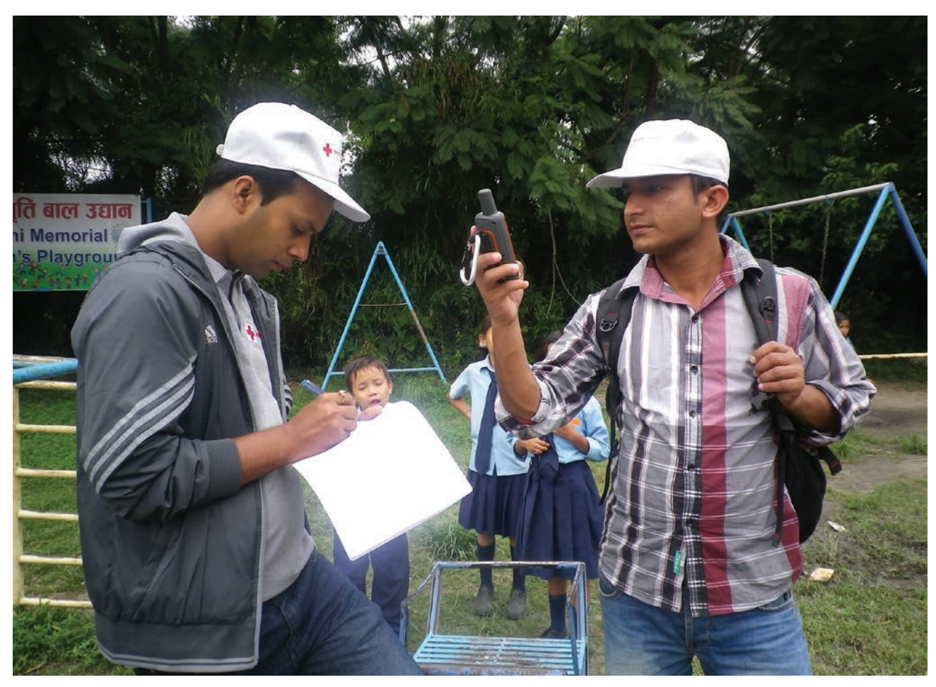
Participatory geographic information system (GIS) training in Bhaktapur, Nepal

organisations that engaged directly with communities and involved them directly in the innovation process. Examples include bringing in diaspora expertise in community-based reconstruction efforts and the engagement of the Nepali cooperative banking sector to finance early response. While it must be noted that such innovations can be localised solutions to problems of response and recovery, and therefore may not always be replicable, the fact is that they are often completely off the radar of international organisations. As a result, novel ideas that could potentially have had positive effects across the response were not fully grasped by international humanitarian organisations.