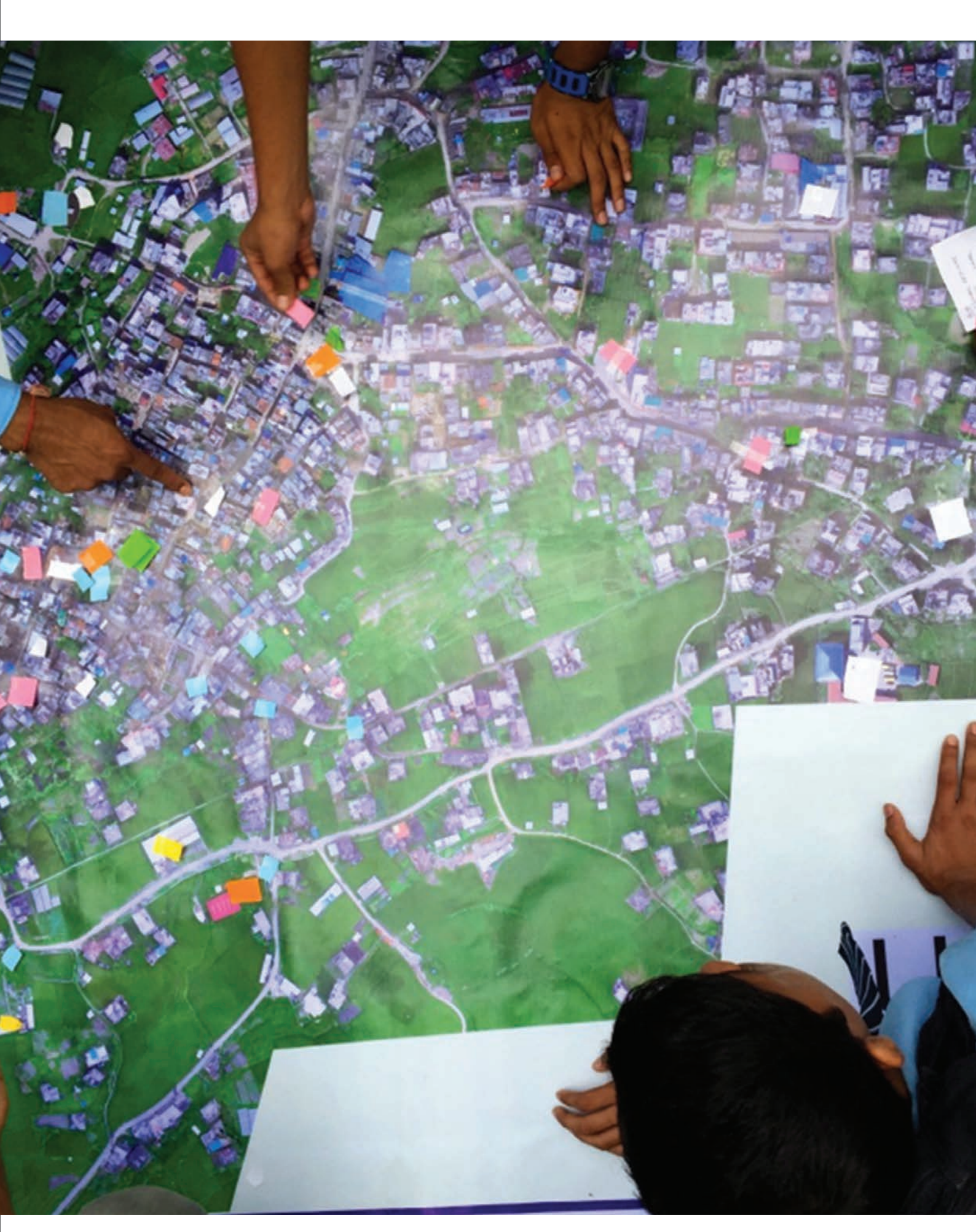
Residents of Panga, Nepal use aerial imagery to take part in a disaster damage assessment