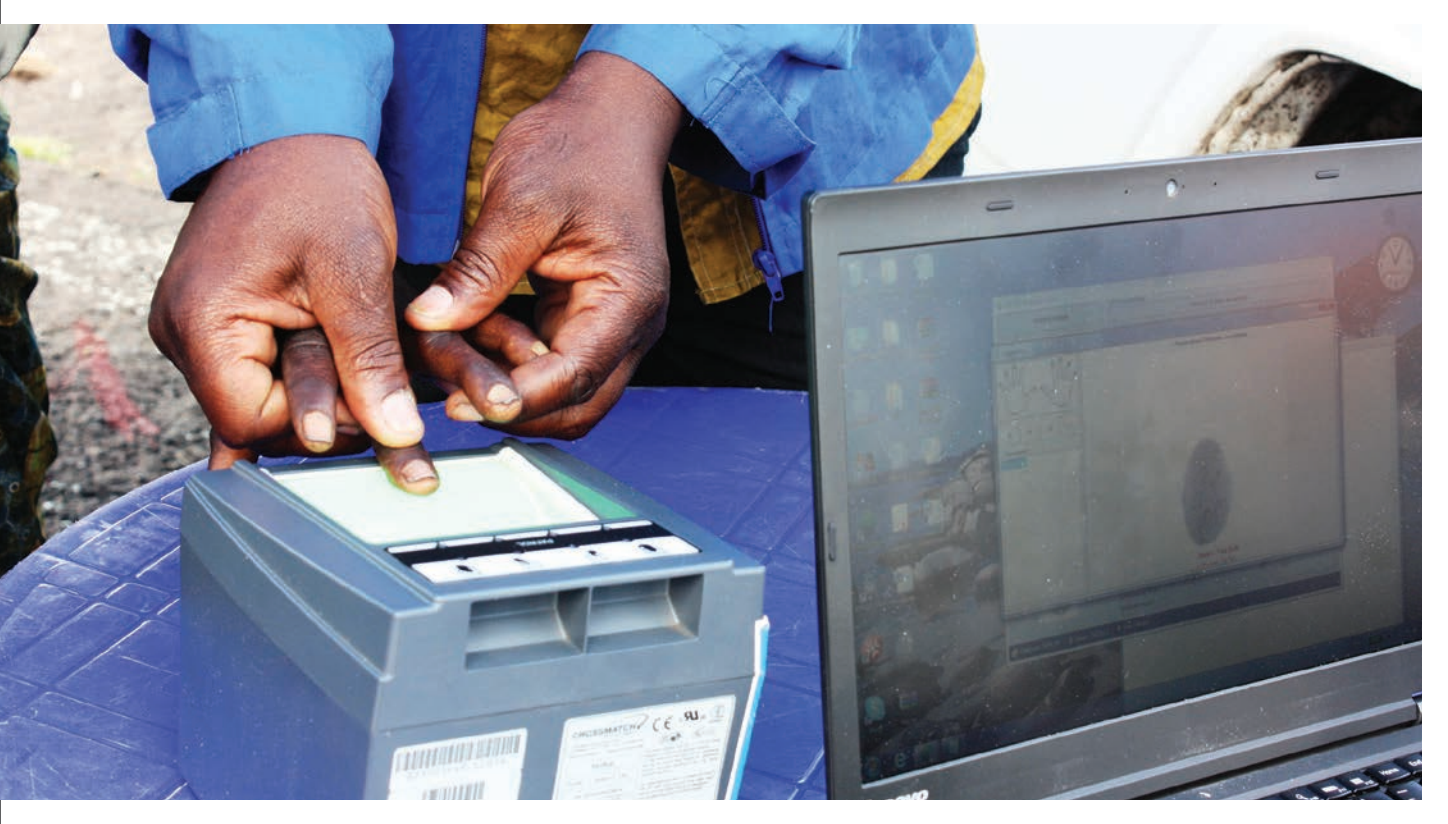
A biometric fingerprint system in use in an IDP camp in North Kivu, Democratic Republic of Congo