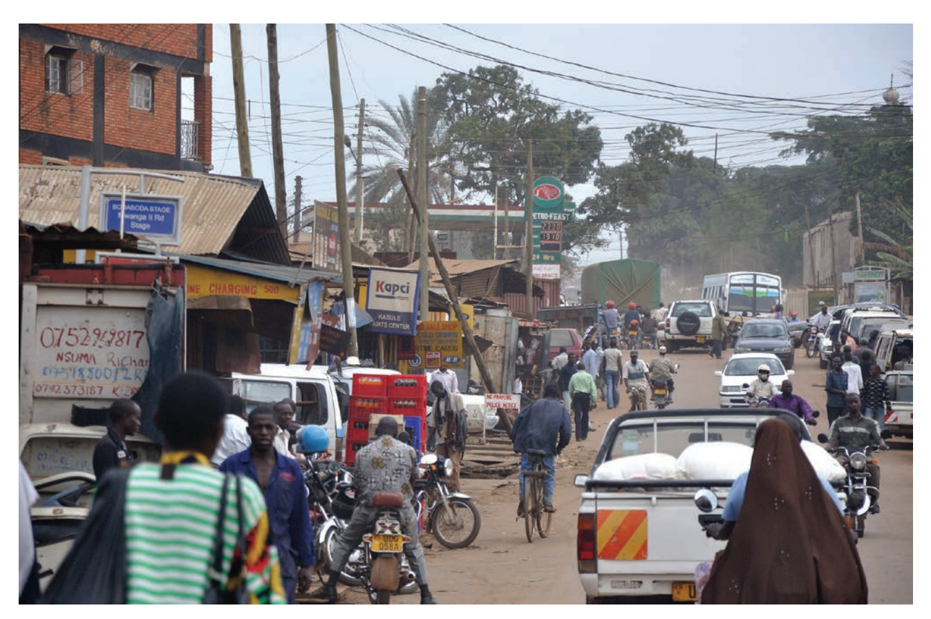
A street view in Kampala, Uganda

particular strengths to our project. Our different positions, for example, give us different sorts of access to informants, a reality that has been aggravating at times but has ultimately served our project well.