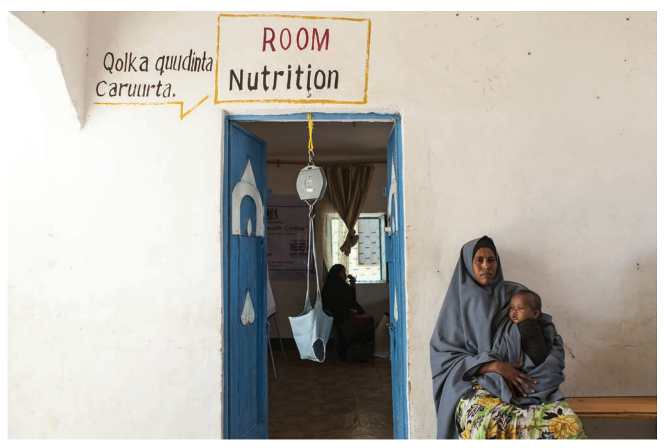
A mother holds her daughter at a health centre in the Karkaar region of Puntland, Somalia

improvement. A comparison with the Puntland programme, which had received a lot of on-site technical support, showed large differences in programme quality, indicating a need for much more regular support of the Hiran programme. The method was then standardised to include documentation, a technical and joint review of documents, feedback and action planning.