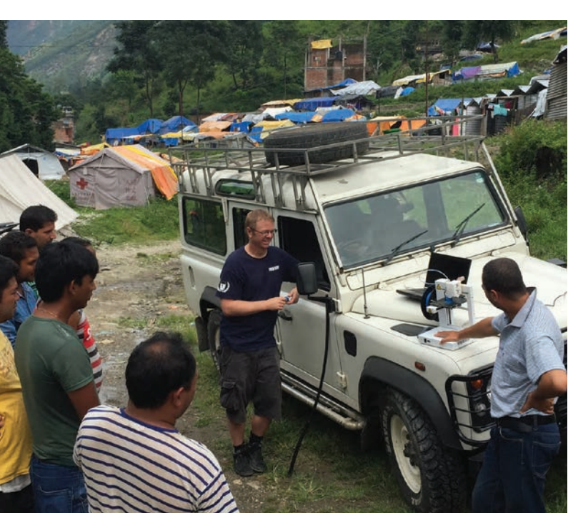
A 3D printer is used to create a fitting for a leaky water pipe in a camp for displaced people in Nepal

equipment for which spares could no longer be purchased. A Field Ready engineer designed a new corner (aiming for greater strength in the area that had been breaking in the originals), printed and tested it, and then redesigned it. On a subsequent visit, Ajeev Bar Singh Thapa, head engineer at the hospital, said that the new corner fitted better than the original, and looked better too. We were able to print sufficient supplies to repair all the baby warmers.