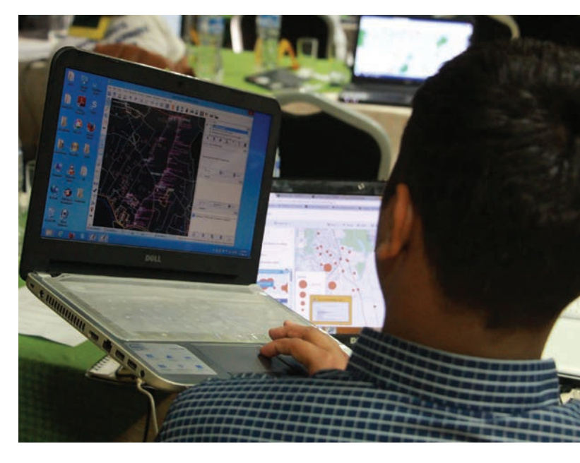
Residents of Pokhara, Nepal learn how to use OpenStreetMap

The earthquake drew an unprecedented response from mappers. By 28 April, 2,200 people had contributed to the