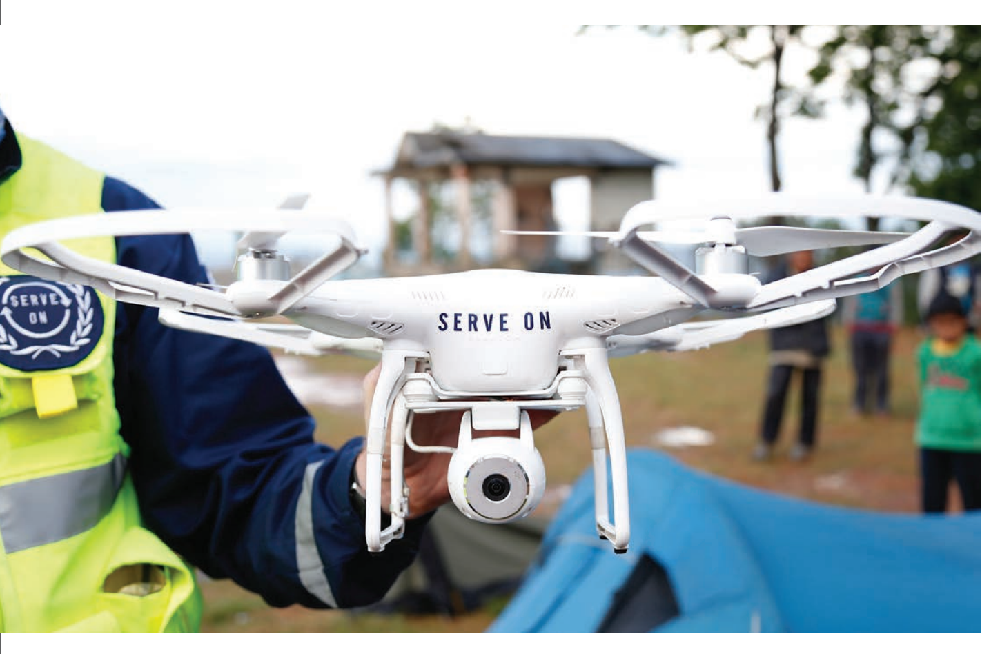
A flying drone used to help identify areas worst-hit by the 2015 Nepal earthquake

Aerial robots are the first wave of robotics to impact the humanitarian space.3 They will certainly not be the last. Popularly known as Unmanned Aerial Vehicles (UAVs) or 'drones', aerial robots have already been used many times in many different situations to collect data in support of disaster response and recovery efforts. The International Organisation for Migration (IOM) has been using aerial robots in Haiti since 2012 to capture aerial imagery to assess disaster damage and displacement. In 2013, Medair and Catholic Relief Services (CRS) used aerial robots to collect imagery to inform their reconstruction and rebuilding efforts following Typhoon Haiyan in the Philippines. The following year, Médecins Sans Frontières (MSF) and the World Health Organisation (WHO) piloted the use of aerial robots for the delivery of small medical payloads (vaccines, medicines) in Papua New Guinea and Bhutan respectively. In 2015, the World Bank used aerial robots in Vanuatu and Tanzania to support disaster response and risk reduction efforts. Several agencies used aerial robots for search and rescue, situational awareness and mapping following the earthquakes in Nepal in 2015. In 2016, the UN Children's Fund (UNICEF) will pilot the use of aerial robots for