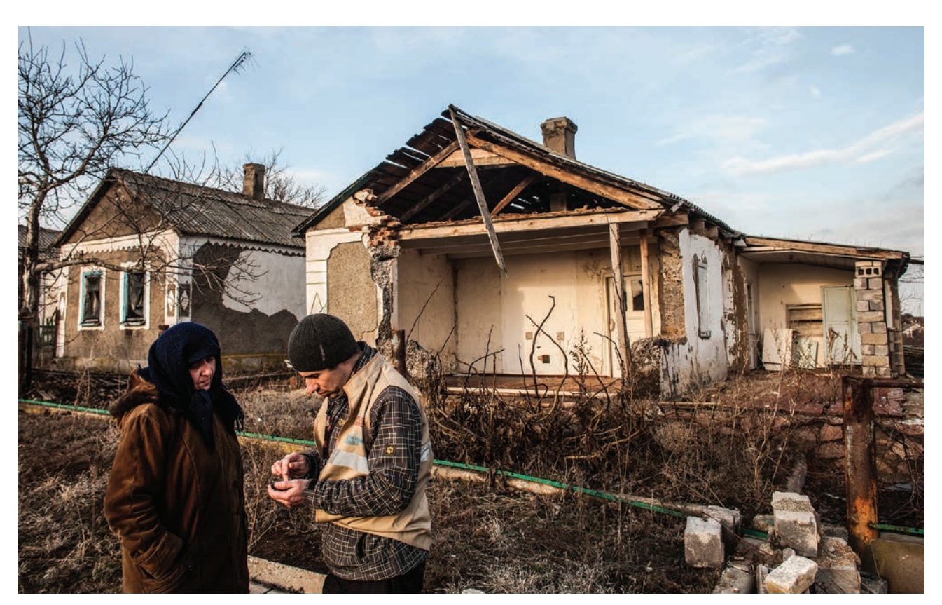
A member of a shelter team speaks with a woman in the village of Hranitne, eastern Ukraine

About 10% of ordnance fails to detonate as expected. This means that, after armed conflict, numerous items of unexploded ordnance pose a threat to the local population. To give an idea of the scope of the mine action intervention required to address contamination, it is commonly estimated that, for every year of armed conflict, roughly ten years will be required to clear affected areas. The armed conflict in eastern Ukraine has now been ongoing for about two years