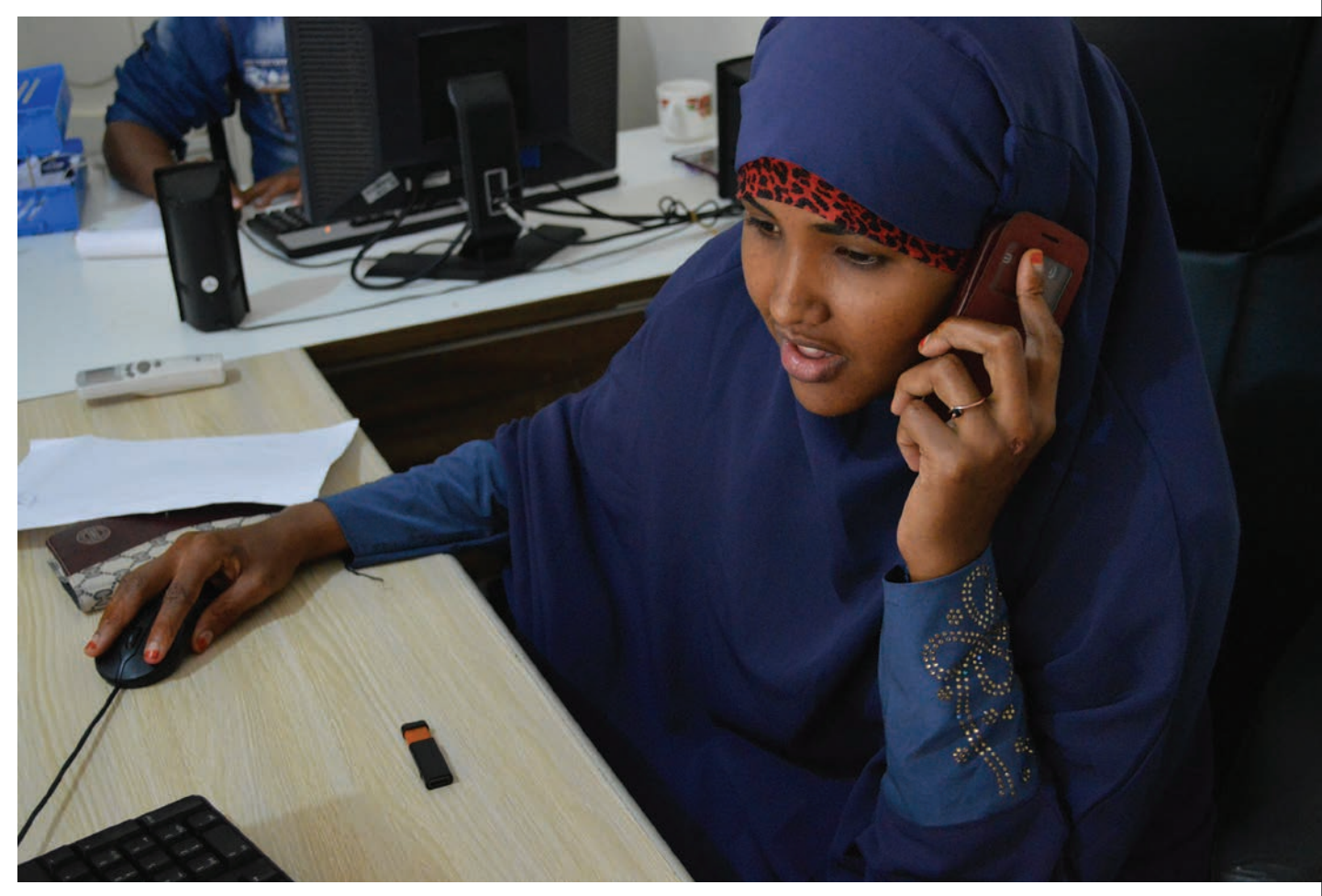
A phone operator for a food security monitoring project in Gaikayo, Somalia

solutionism is limiting the effectiveness of current humanitarian uses of technologies and stymieing their ethical application.<sup>4</sup> Humanitarian actors are, in many cases, deploying ICT solutions in search of potential problems to solve, rather than first identifying the most urgent problems and then ensuring that the proper tool is being used correctly to address them. Additionally, these ICT solutions largely lack clear standards for how they should be responsibly applied if and when specific cases are identified.