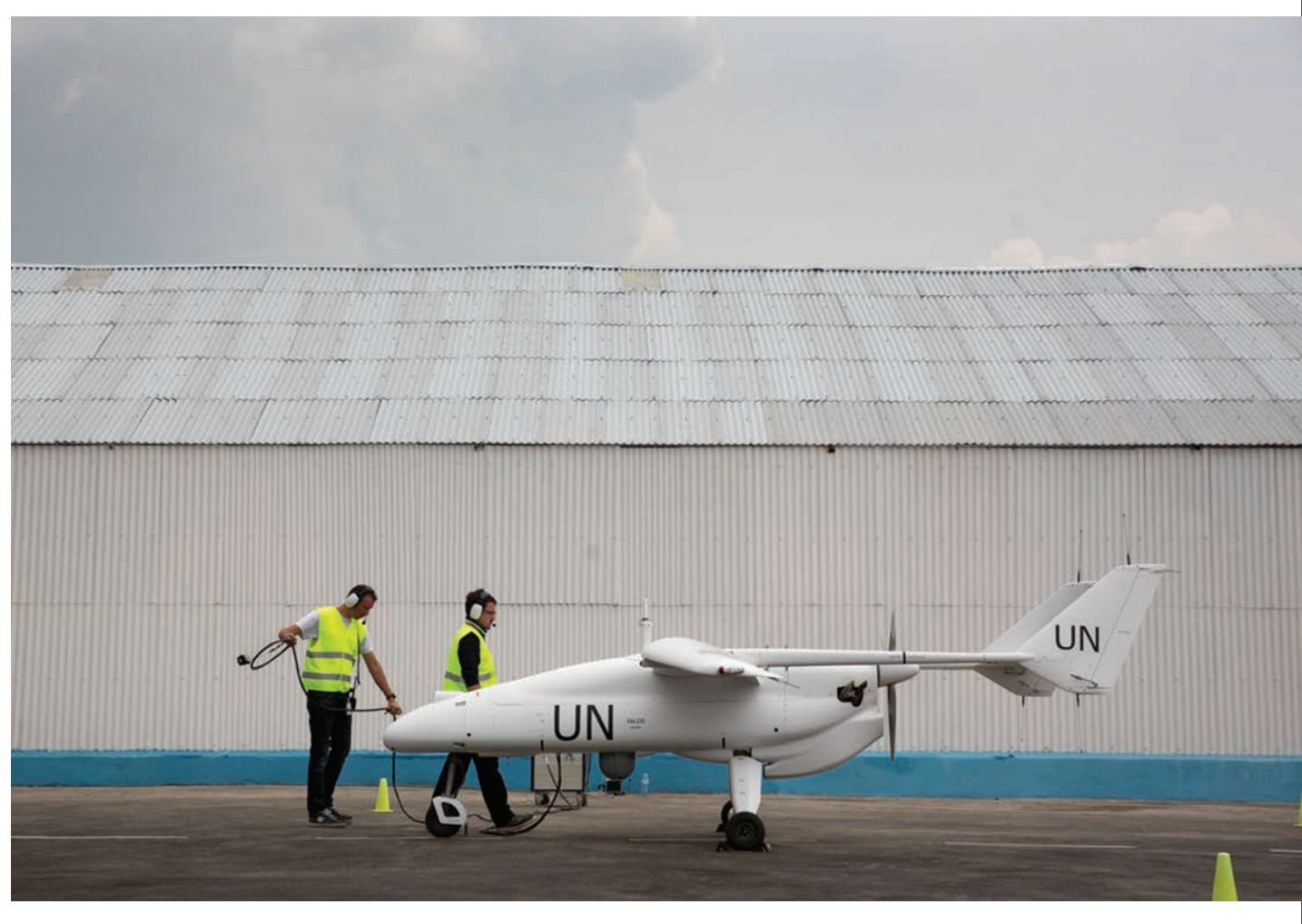
An Unmanned/Unarmed Aerial Vehicle is prepared for flight in North Kivu, Democratic Republic of Congo

Too little is understood about the risks that the diffusion of military innovation may pose to humanitarian practice and principles. Yet critical perspectives do not need to compete with work to identify possible areas of synergy and exchange. An informed, considered debate should pursue these research streams, balancing an investigation of the potential benefits of military innovations with critical dialogue on the associated risks.