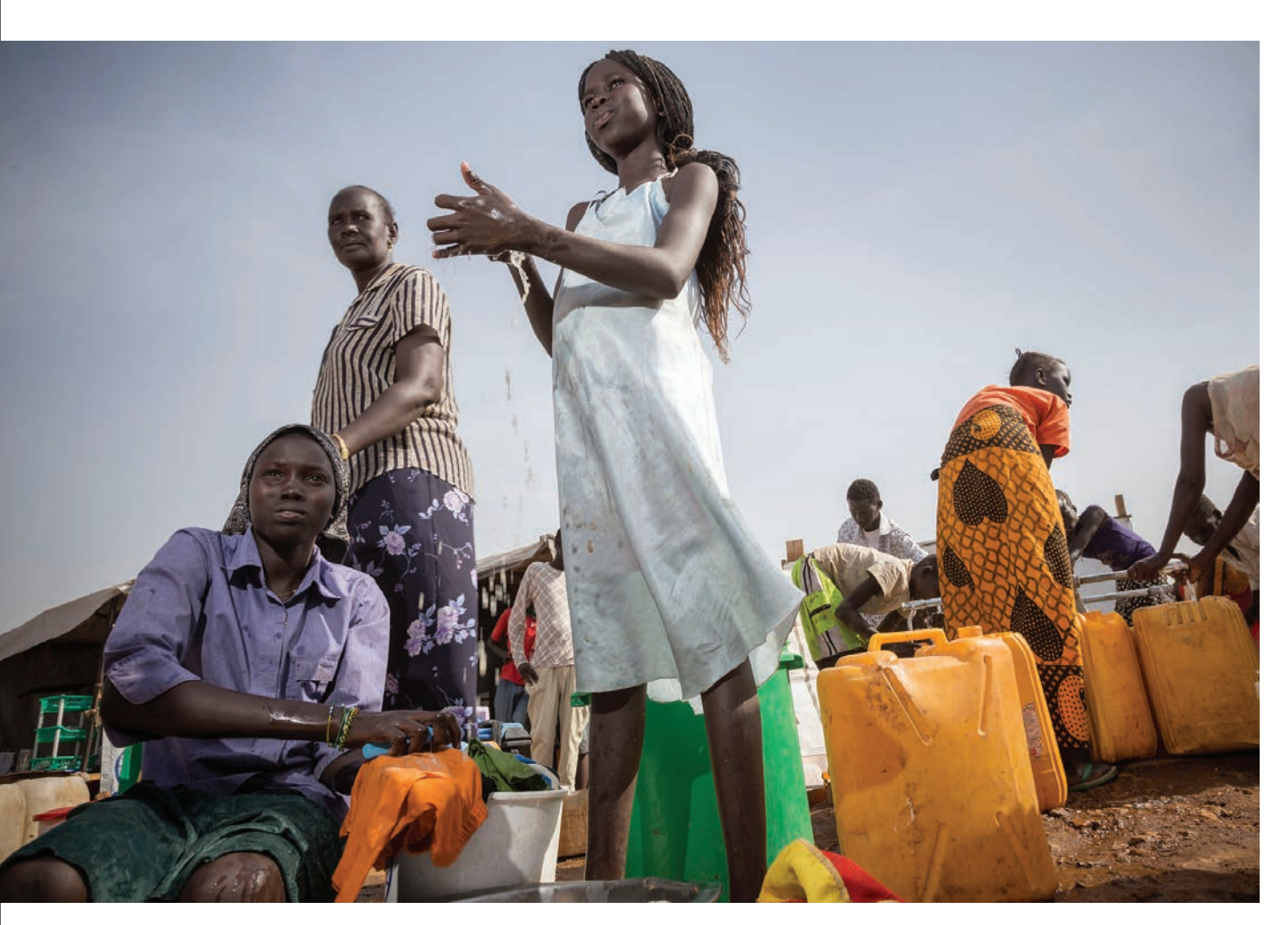
Water points in Juba, South Sudan

by Oxfam GB and the University of Surrey, overcomes the limitations of other technologies challenged by high turbidities whilst maintaining a high production yield. However, one shortcoming was the limited involvement of the kit's potential operators (i.e. field staff) during its development; practitioners saw its set-up and operation as too complicated, and it was not widely adopted despite being considered one of the most costefficient emergency systems available. Further involvement of potential end-users in its development could have helped simplify the system and increase uptake in the field.