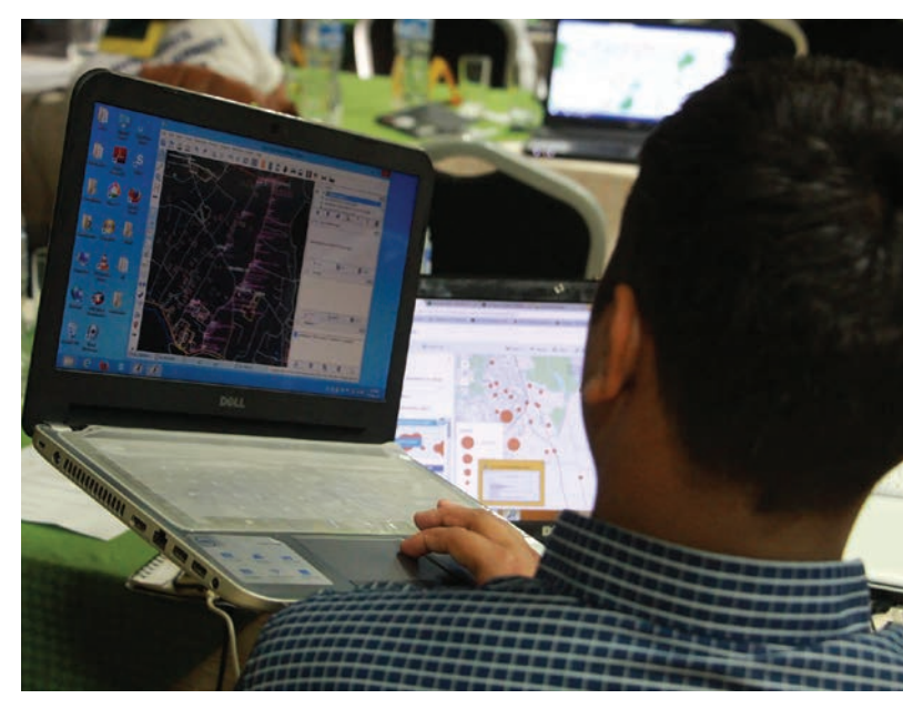
Residents of Pokhara, Nepal learn how to use OpenStreetMap

The earthquake drew an unprecedented response from mappers. By 28 April, 2,200 people had contributed to the