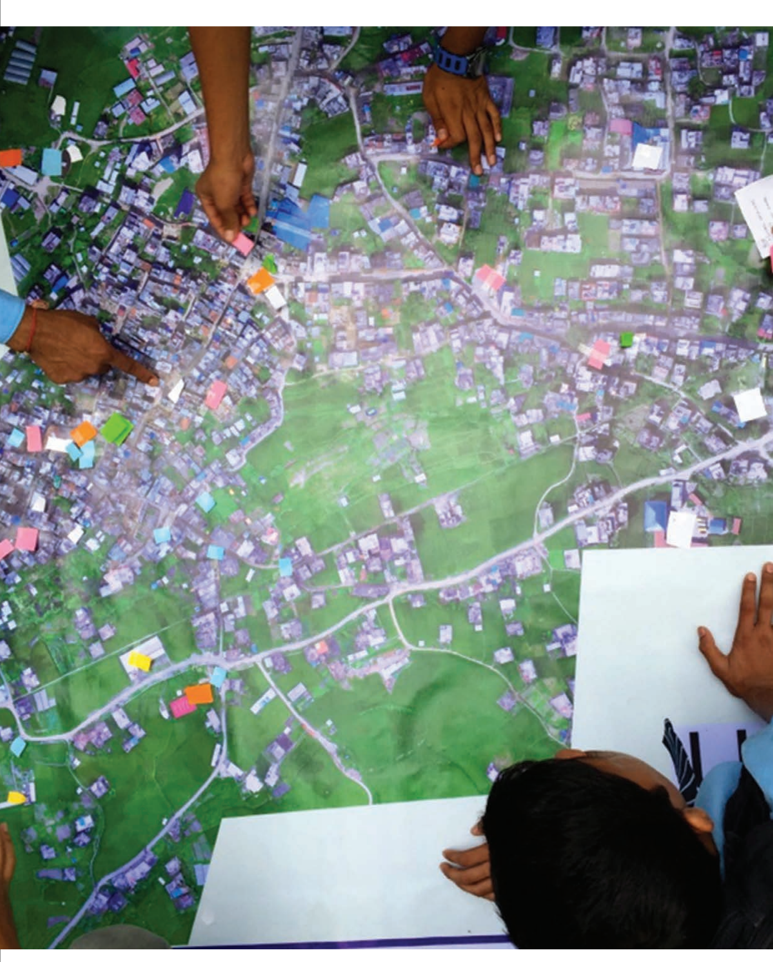
Residents of Panga, Nepal use aerial imagery to take part in a disaster damage assessment