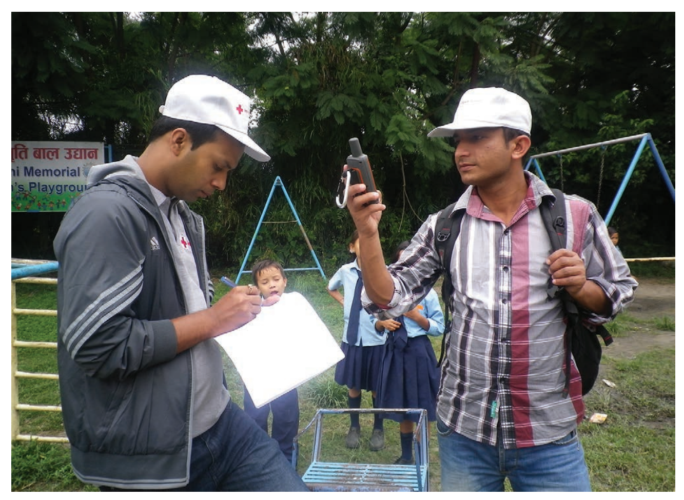
Participatory geographic information system (GIS) training in Bhaktapur, Nepal

organisations that engaged directly with communities and involved them directly in the innovation process. Examples include bringing in diaspora expertise in community-based reconstruction efforts and the engagement of the Nepali cooperative banking sector to finance early response. While it must be noted that such innovations can be localised solutions to problems of response and recovery, and therefore may not always be replicable, the fact is that they are often completely off the radar of international organisations. As a result, novel ideas that could potentially have had positive effects across the response were not fully grasped by international humanitarian organisations.