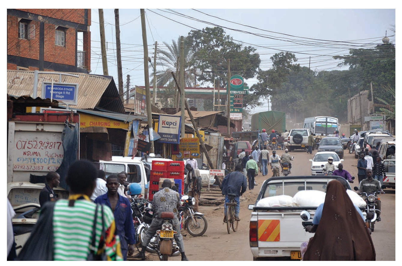
A street view in Kampala, Uganda

particular strengths to our project. Our different positions, for example, give us different sorts of access to informants, a reality that has been aggravating at times but has ultimately served our project well.