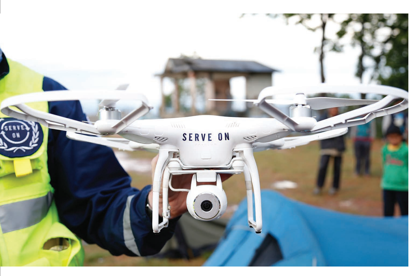
A flying drone used to help identify areas worst-hit by the 2015 Nepal earthquake

Aerial robots are the first wave of robotics to impact the humanitarian space.3 They will certainly not be the last. Popularly known as Unmanned Aerial Vehicles (UAVs) or 'drones', aerial robots have already been used many times in many different situations to collect data in support of disaster response and recovery efforts. The International Organisation for Migration (IOM) has been using aerial robots in Haiti since 2012 to capture aerial imagery to assess disaster damage and displacement. In 2013, Medair and Catholic Relief Services (CRS) used aerial robots to collect imagery to inform their reconstruction and rebuilding efforts following Typhoon Haiyan in the Philippines. The following year, Médecins Sans Frontières (MSF) and the World Health Organisation (WHO) piloted the use of aerial robots for the delivery of small medical payloads (vaccines, medicines) in Papua New Guinea and Bhutan respectively. In 2015, the World Bank used aerial robots in Vanuatu and Tanzania to support disaster response and risk reduction efforts. Several agencies used aerial robots for search and rescue, situational awareness and mapping following the earthquakes in Nepal in 2015. In 2016, the UN Children's Fund (UNICEF) will pilot the use of aerial robots for