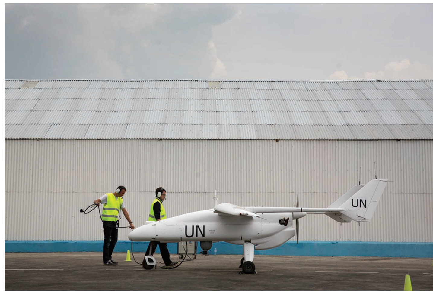
An Unmanned/Unarmed Aerial Vehicle is prepared for flight in North Kivu, Democratic Republic of Congo

Too little is understood about the risks that the diffusion of military innovation may pose to humanitarian practice and principles. Yet critical perspectives do not need to compete with work to identify possible areas of synergy and exchange. An informed, considered debate should pursue these research streams, balancing an investigation of the potential benefits of military innovations with critical dialogue on the associated risks.