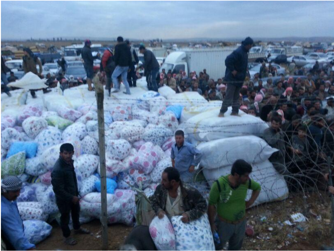
Figure 3 Distribution to IDPs at Tel Shair