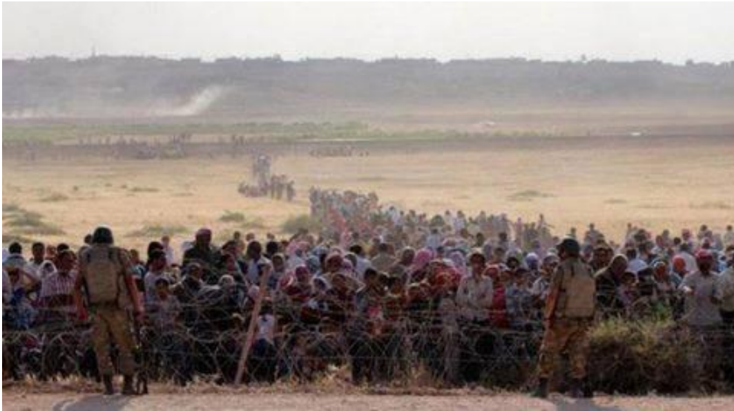
Figure 2 People from Kobani at the Syrian-Turkish border