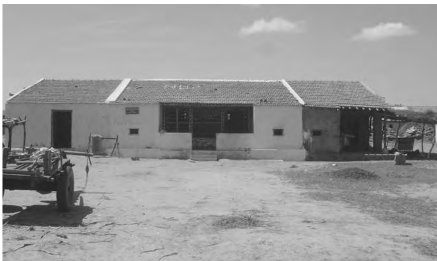
An SHA house in Rapar Taluka (Kachch district)

This case study focuses on an NGO (called 'SHA') which offered post-earthquake housing assistance to seven remote hamlets in Rapar Taluka (Kachch district), inhabited by a total of 270 households. Our research looked specifically at two remote hamlets, and our survey covered a sample of 21 households. The NGO provided construction materials worth Rs25,000 per household and some technical guidance. Approximately 20% of the households in these villages were not entitled to any government compensation because their dwellings were not officially registered. To these households, SHA offered full housing