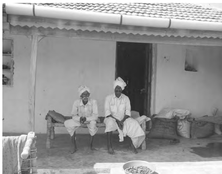
A PHA house in Patan District

PHA targeted poorer households on the ground that they could not rely on sufficient government compensation to restore or improve their housing on their own. It opted for traditional local construction techniques and materials (stone walls with cement mortar and tiled roofs), and trained and employed local labourers. Beneficiaries were involved in finalising designs, and house owners were expected to contribute labour throughout the construction period. Particular emphasis was given to training women. The agency provided an extendable core unit consisting of a living space of 20m 2 , plus sanitary facilities (a single-pit pour-flush latrine), to which people could add additional rooms as their needs and circumstances allowed. Although