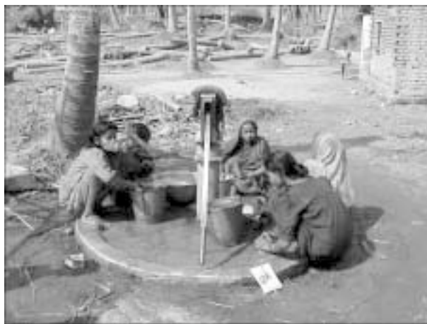
Village scene, Orissa

Artisans. Artisans depend on sales of their products, and cultivation/wage labour on farms. Many artisans in cyclone-affected areas lost their tools, workshops and raw materials. Even where craftsmen could still work, there was no demand for their products following the cyclone.