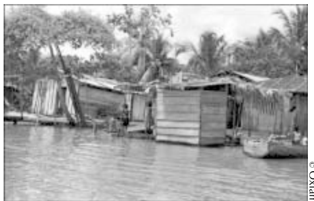
IDP settlement, Uraba