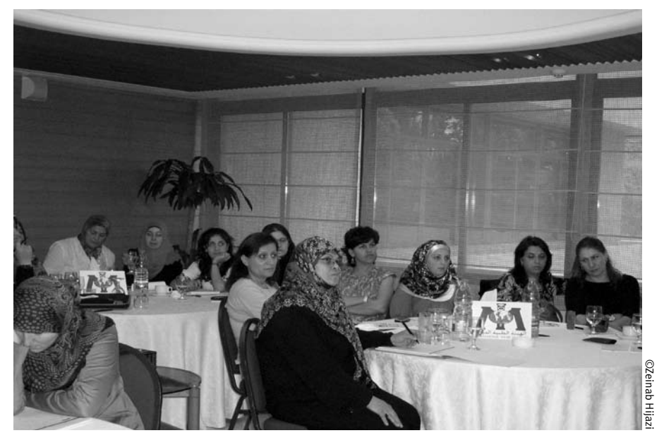
Refresher training for mid-level staff

health average just 5%, lower than most European states but higher than the global average of 3.2%.