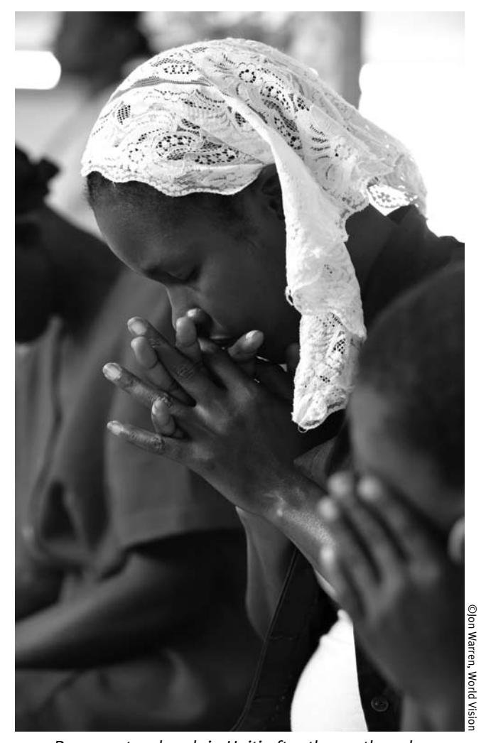
Prayers at a church in Haiti after the earthquake