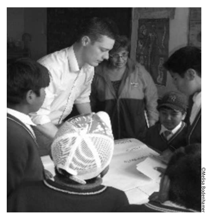
Field testing with schoolchildren in Oruro

The development of common DRR tools in Bolivia is in its early days, and it will be interesting to see how the process develops in the coming months and years. Could it be that large agencies such as World Vision may sometimes need to reconsider how they develop tools and approaches? Rather