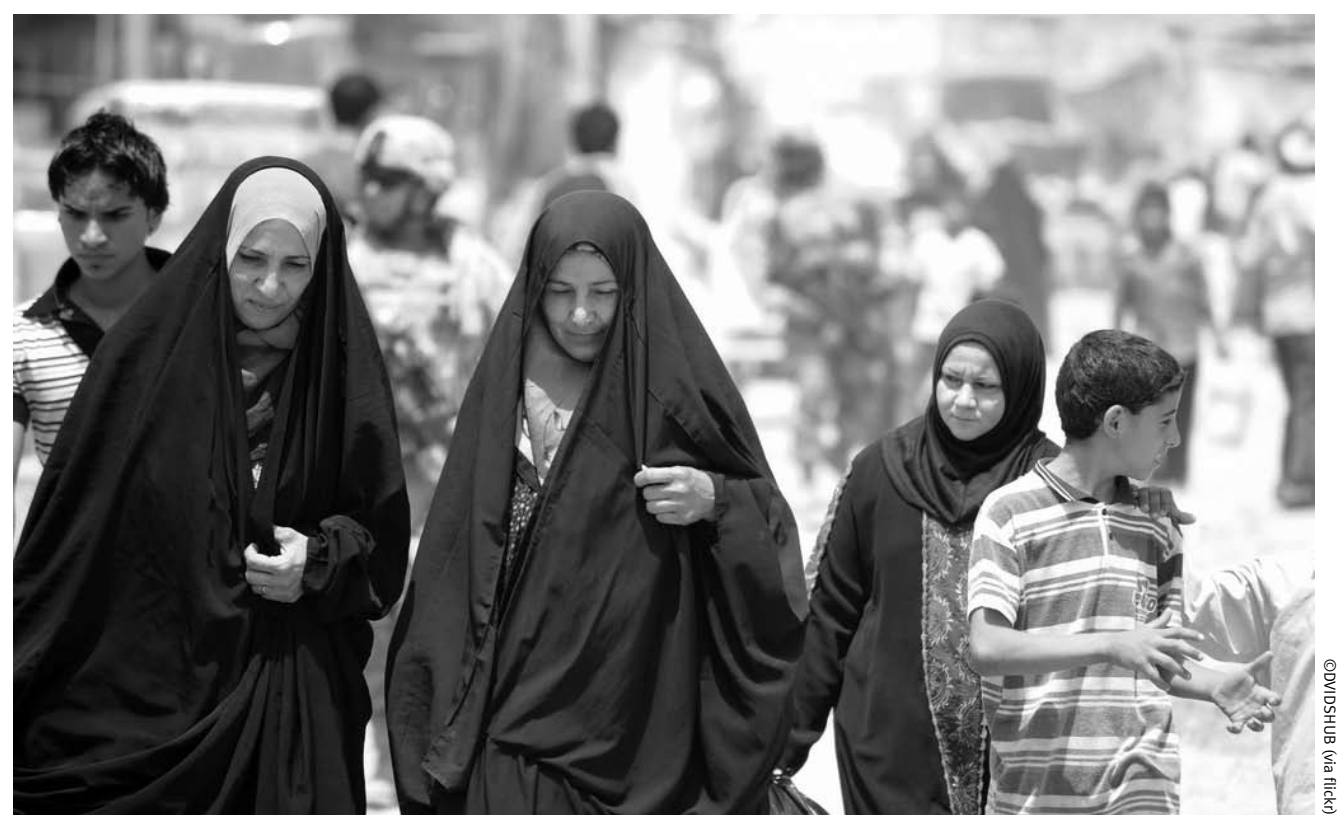
Iraqi women in eastern Baghdad

the process. The ICRC also monitors how the administrative system functions and identifies bottlenecks. This information is discussed at central level with the administration at regular meetings. The project has helped to identify the need for higher-level advocacy in order to address structural shortcomings, one of which is the multiplicity of actors involved in the welfare allowance system: parliamentarians vote on the social affairs budget; the Ministry of Social Affairs decides which proportion goes to WHHs; the Directorate of Women registers beneficiaries; and the governorates (provincial councils) release the payments. The lack of coordination between actors involved and the lack of an overall budget dedicated to WHHs are serious impediments to efforts to meet the needs of these households. The ICRC uses high-level meetings with interlocutors in Iraq to raise these problems, and organised a national conference in June to discuss the issue with key stakeholders.