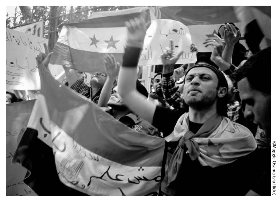
Syrian protesters in front of the Syrian embassy in Cairo

The popular uprisings sweeping through North Africa and the Middle East, from Tunisia in the west to Syria in the east, and the generally violent response to them from state authorities, are challenging humanitarian organisations and policymakers in new ways. These are not 'classic' humanitarian emergencies, which are often associated with hunger, epidemics, displacement and a desperate daily struggle for survival. These crises are happening mainly in middle-income countries, in urban settings with functioning basic social services, and affecting a cross-section of the population. These crises have not developed into large-scale humanitarian emergencies - at least not yet. But they do demand new ways of thinking and working.