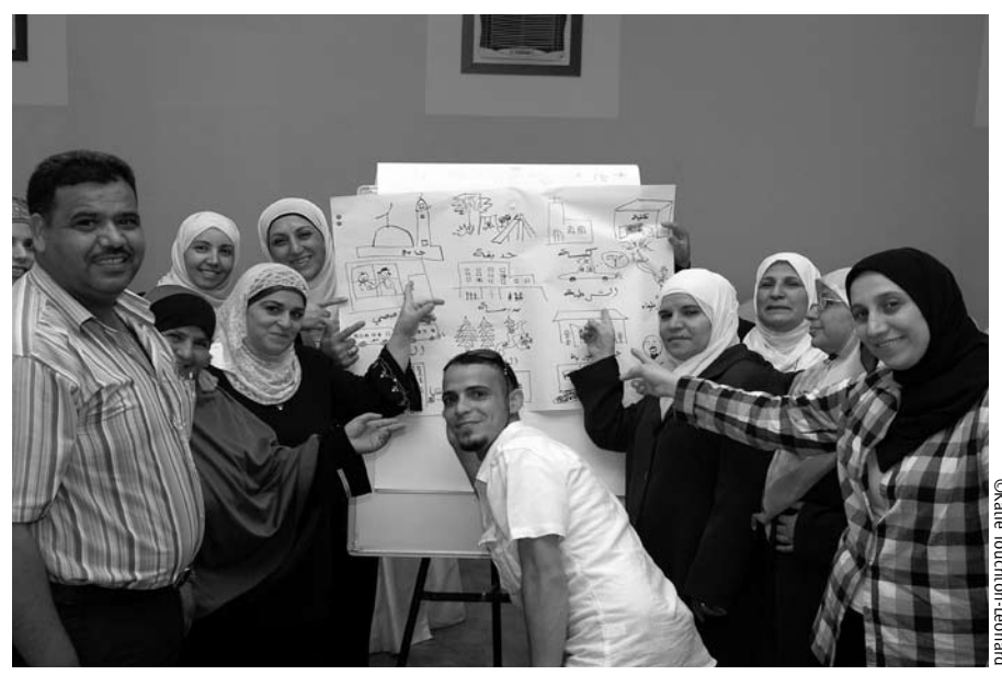
Mapping community resources

CARE began providing targeted humanitarian assistance to Iraqi refugees in 2007, primarily through partnerships with local Jordanian charities. CARE conducted a comprehensive mapping of over 30 Jordanian charities, from which 14 local partners were selected. A comprehensive assistance package was developed, including seconded social workers who conducted needs assessments and provided information on services and how and where to access them,