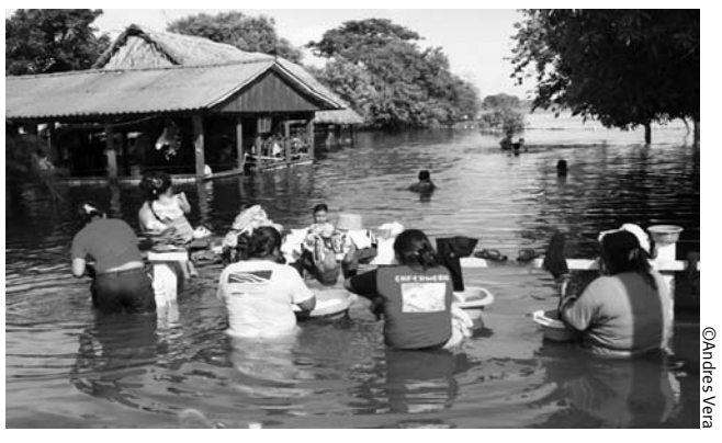
Agencies are coming together to help communities prepare for disasters like this 2008 flood

1 The Emergency Capacity Building Project is a global partnership between CARE, CRS, Oxfam, Mercy Corp and World Vision. For more see http://www.ecbproject.org.