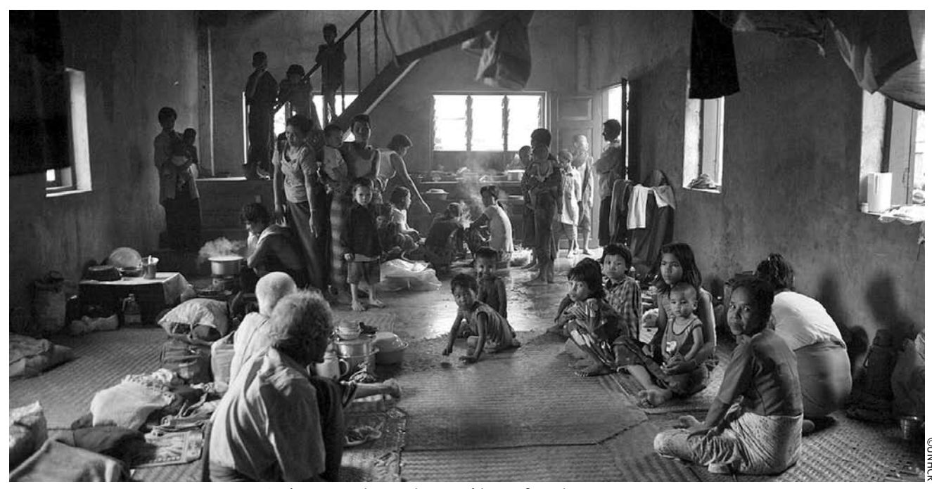
Cyclone Nargis survivors taking refuge in a monastery

1 Main criteria for an LNGO to be included in the directory are the following: being willing to be in the directory, having an office in Yangon, and being non-profit, independent and with a clear leadership. CBI is an LNGO that provides capacity-building for Myanmar NGOs.