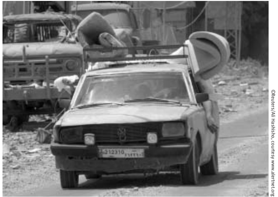
A family flees Israeli attack, Tyre, Southern Lebanon, July 2006

OCHA played an important advocacy role, and the human rights story was well covered by the media and in campaigns by local and international NGOs. Senior UN officials and coalitions of NGOs engaged in direct and bold advocacy and policy initiatives to call first for a ceasefire and/or humanitarian access, and later for the protection of civilians (although the Office of the High Commissioner for Human Rights (OHCHR) called for a high-level commission in 11 August, OHCHR was a notable absentee in Lebanon). This resulted in widespread reporting and condemnation of the extent of civilian deaths during the conflict. Children have been a particular focus (it has been estimated that between one-third and a half of all casualties were children). On the ground, many organisations supported the clearing up of destroyed buildings, disseminated material to raise awareness of unexploded ordnance and landmines and help with psychosocial recovery, set up safe play areas and delivered schools kits for children, many of which were brought from partner organisations and offices in the oPt. Schools restarted only a month later than they would have done had the conflict not intervened.