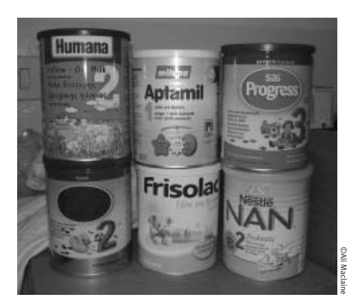
Tins of formula milk imported and donated by INGOs. Labels are in English or Greek, not Arabic

While inter-sectoral collaboration is essential, inter-agency cooperation is also vital in the field. UNICEF was the Nutrition Cluster lead in Lebanon, and is also the IYCF coordinating body in the field, as set out in the Ops Guidance. However, the success of a cluster rests largely with the coordinator, and in Lebanon UNICEF appeared unable to