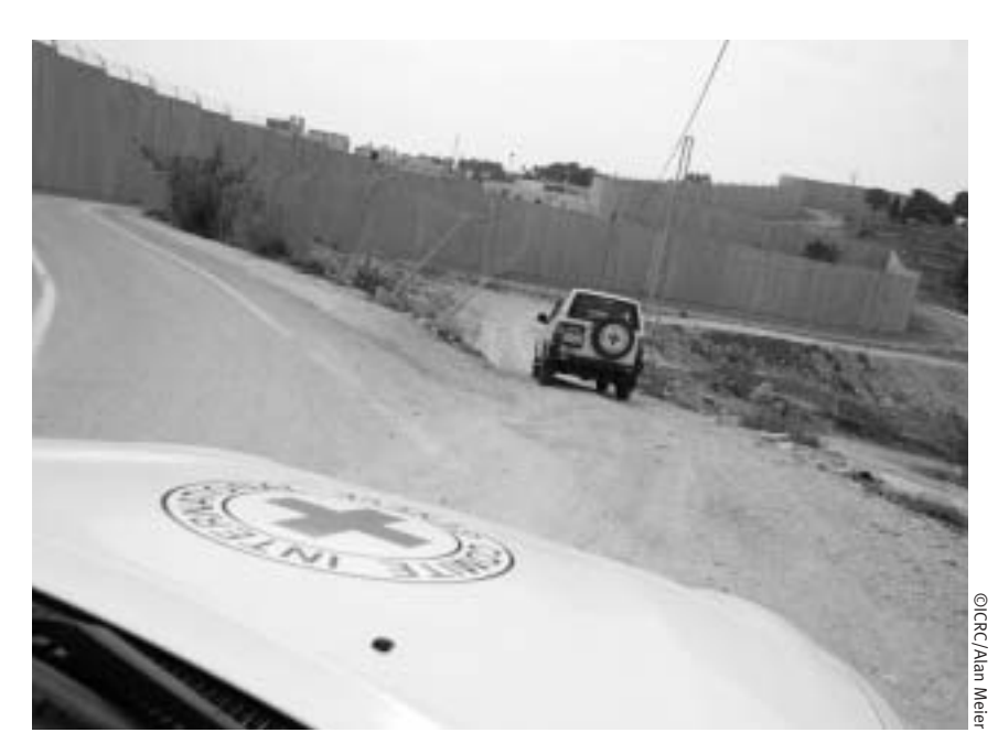
An ICRC team visits Abu Dis, a hard-to-reach neighbourhood cut off both from the West Bank and from Jerusalem

Neutrality, independence and impartiality define the action of the ICRC and of the Red Cross and Red Crescent Movement worldwide. These core principles result from the ICRC's double role as guardian of IHL, and as a humanitarian organisation seeking to protect and assist all victims of armed conflict.