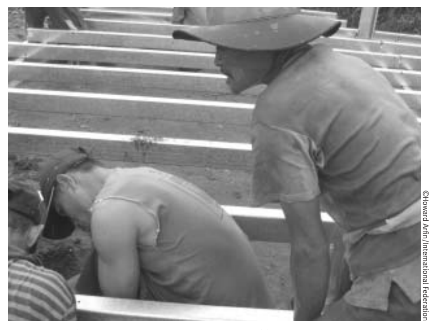
Workers prepare frames for transitional housing in Indonesia

This is particularly important where reconstruction involves improvements to traditional building methods. For instance, the use of beneficiary labour in Aceh provided hands-on opportunities for training in seismic resistance (Box 1). As noted in Box 1, however, community participation should not necessarily imply community control. Unrealistic expectations arose during community consultations in Sri Lanka and Aceh. For example, Western-style concrete structures might requested because they represent 'development' and 'progress', even though they are less suited to the climate and to other environmental hazards in the area.