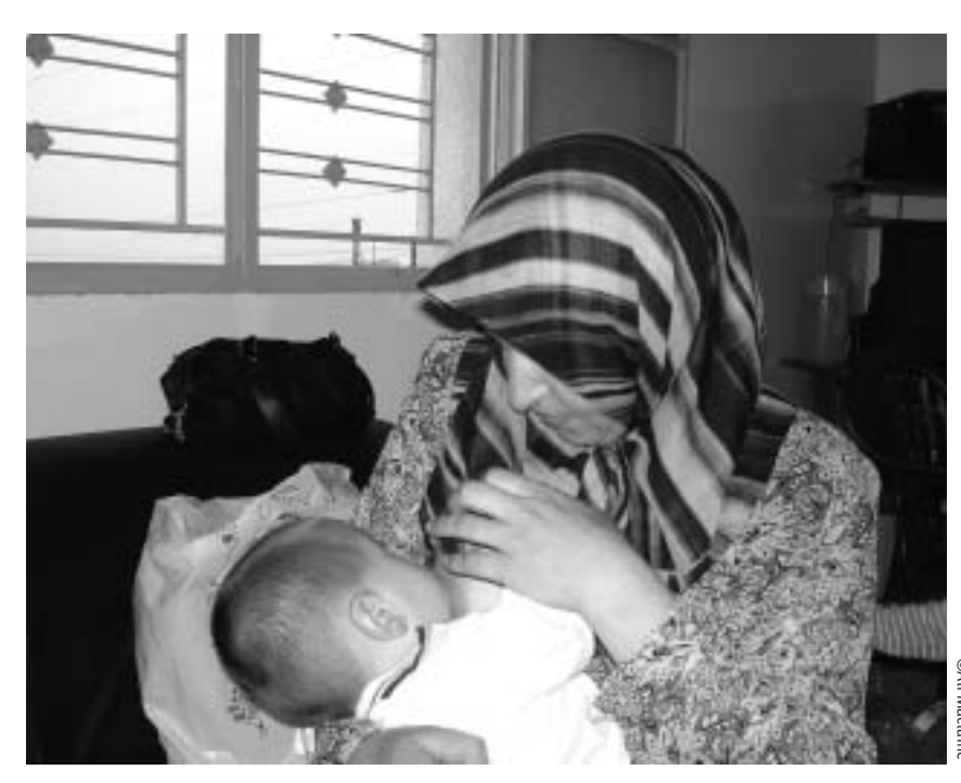
A mother breastfeeding her child

The provision of infant formula and milk for infants and young children is a very emotive subject, especially during emergencies.1 NGOs have been struggling with how to tackle this problem since the early 1990s, when emergencies in countries such as Iraq revealed that a significant percentage of women had been using breastmilk substitute (BMS) before the crisis occurred.2 Previously, relief work had focused on countries where the pre-crisis breastfeeding rate was nearly 100%; although breastfeeding practices were often less than ideal, at least that lifeline for infants was there. However, even when relief agencies knew the benefits of breastfeeding and the dangers of BMS, especially during emergencies, they felt that they had to do something to support affected infants, and so often distributed infant formula - untargeted, unmonitored and without follow-up.