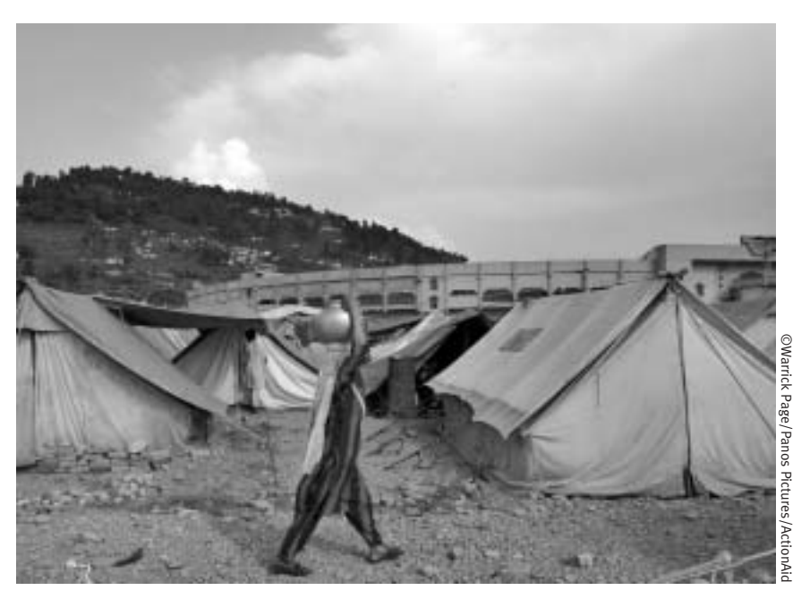
A woman carries water to her family in a tent village in Muzaffarabad, September 2006

Nine clusters were subsequently defined under three broad headings: Service Provision, which encompassed logistics and emergency telecommunications; Relief and Assistance to beneficiaries, which covered emergency shelter, health, nutrition and water hygiene and sanitation; and Cross-