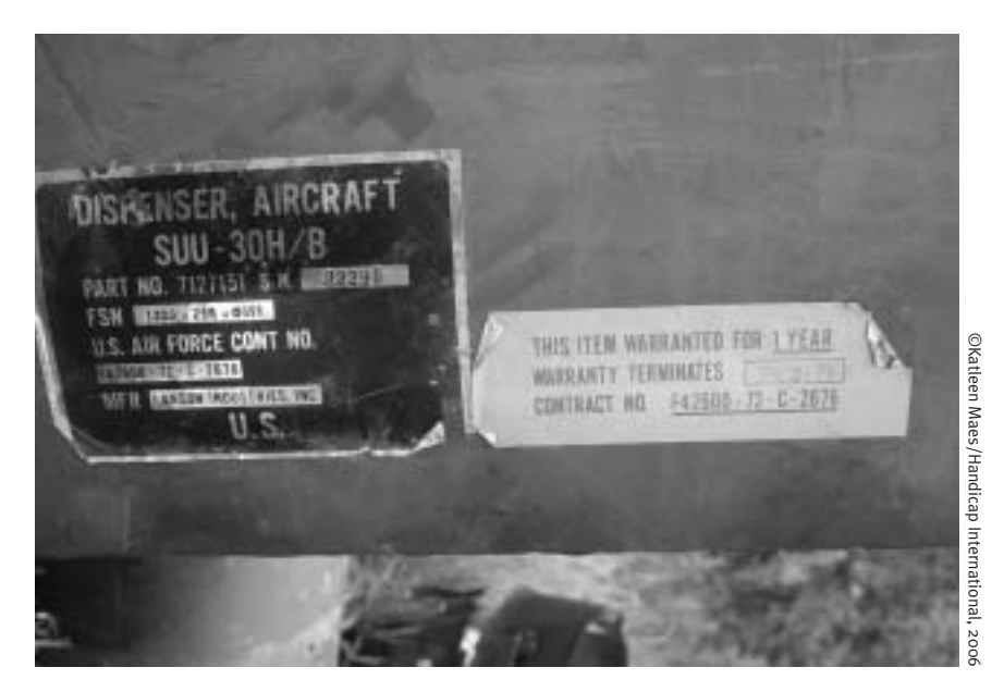
A cluster munitions dispenser in Lebanon showing the expiry date of the one-year warranty in 1974

1 All the case examples used in this article were collected during Handicap International field missions.